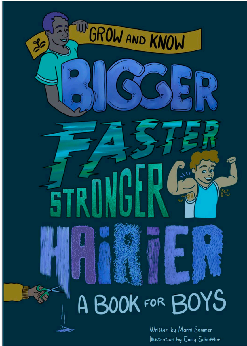
Image: Developing the USA boy's puberty book